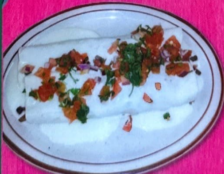
BURRITO CHEESE STEAK