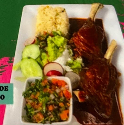
MIXIOTE DE BORREGO