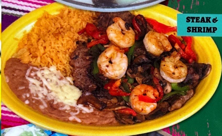
STEAK & SHRIMP