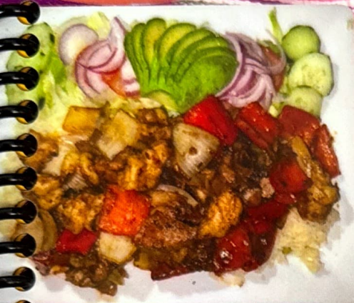
BROCHETA DE CAMARONES