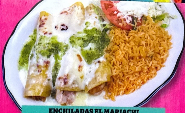
ENCHILADAS EL MARIACHI