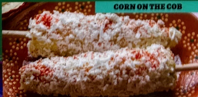
CORN ON THE COB