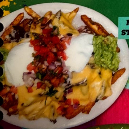
MARIACHI STEAK FRIES

Steak, chicken and shrimp over a bed of rice, covered with cheese dip. 15.99